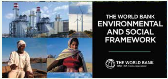
Environmental and Social Framework of World Bank

The World Bank Environmental and Social Framework document is a safeguard for protection of natural environment by any type of development work. It's a new commitment made by WB for sustainable development.