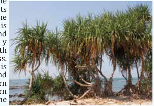
before Keya-bush at Chhera Dwip of Saint Martin's Island beach.

However, few spectacular patch of Large Screw Pine is found in Chhera Dwip.