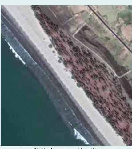
a. 2009: High dense Jhau Trees b. 2015: Low dense Jhau Trees c. 2018: Low dense Jhau Trees Figure-2: Deforestation of Jhau Plantation at near Inani, Jalia Palong Union, Ukhia Upazila, Cox's Bazar