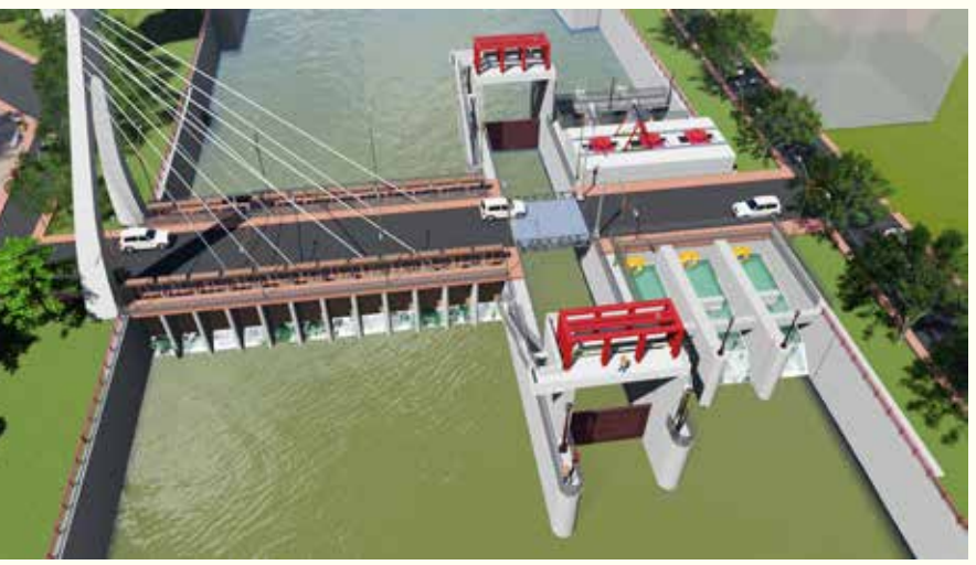
3D view Design of Mohesh Khal Regulator

Drainage modeling works have been divided into two components. Firstly, a Coastal Hydrodynamic Model has been simulated using Delft3D for the river system encompassing Chattogram City namely, Karnaphuli and Halda with a small portion of the Eastern Bay of Bengal. The Bay was taken into account to simulate the tidal influx into the Karnaphuli River which in turn, at the current virgin state, enters the city through the major khal systems. Downstream boundary for the model has been taken from the Bay of Bengal Model developed by CEGIS using Delft3D Flexible Mesh Suite. Upstream discharge boundary for the model was taken just at the upstream of Kalurghat and the bathymetry for Karnaphuli was generated using River Cross-section data. The model simulates the tidal nature of the river and its interaction with the Bay and provides tidal water levels at required locations along the river, at primary khal outfalls such as Chaktai, Noa, Mohesh etc. The main hydrodynamic model for simulating the existing drainage conditions in Chattogram has been developed using the SOBEK Suite. Pre-processing for model development involved frequency analysis of 30-year daily Rainfall data for the BMD Chattogram Station whereby a 1-day rainfall event of 511 mm with an unprecedented Return Period of