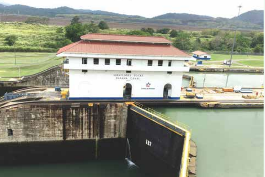
Navigation Lock at Panama Canal, Panama City

Being in close proximity to the Bay of Bengal, Chattogram faces the brunt of virtually of all modern climate change