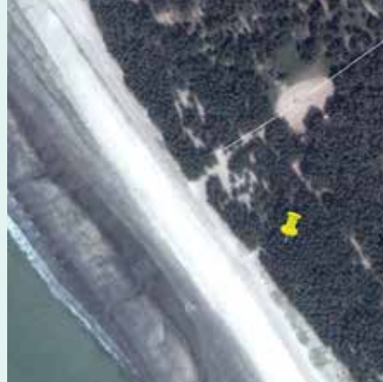
b. 2011: Matured Jhau Trees Figure-3: Erosion of Jhau Plantation at near Bahar Chara, Cox's Bazar