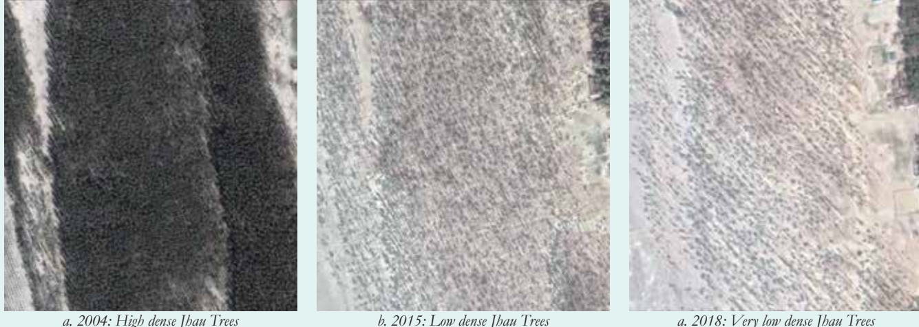
b. 2015: Low dense Jhau Trees Figure-1: Degradation of Jhau Plantation at Khurushkul Union, Cox's Bazar

Khurushkul Union of Cox's Bazar have been degraded severely between 2004 and 2018. The degradation of Jhau Plantation near Inani is shown in Figure-2. There was high density of Jhau Trees in 2009 (Figure-2a) but gradually decreased by 2018 (Figure-2b and Figure-2c). Figure-3a, Figure-3b, and Figure-3c show how the Jhau plantation near Cox's Bazar Paurashava has been eroded between 2006 and 2016. Based on preliminary findings from satellite image analysis, DoE showed interest to find out the causes of degradation, deforestation and erosion of Jhau plantation. In this regard, CEGIS was engaged to carry out the study.