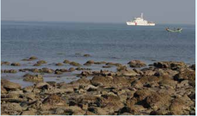
St. Martin's Island, Cox's Bazar - a unique biodiversity

The present project component "Natural Resource Survey and other related activities" is an effort to collect in-depth required information in order to be able to plan conservation actions vis-a-vis developing a Conservation Management Plan (CMP) for the island to be implemented subsequently for ensuring sustainable conservation of the island's resources.