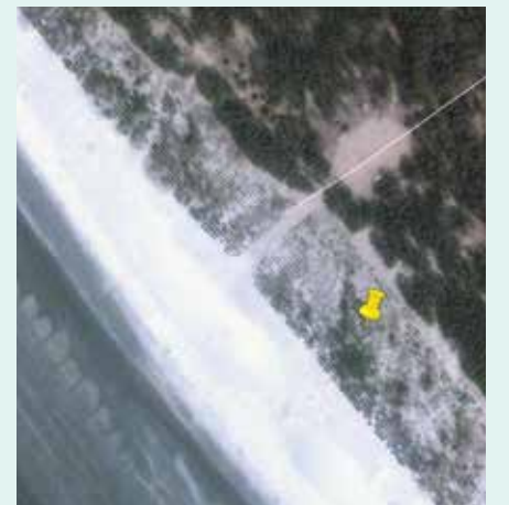
a. 2006: Jhau Tree Plantation