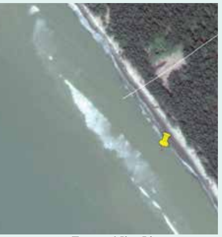
c. 2016: Erosion of Jhau Plantation